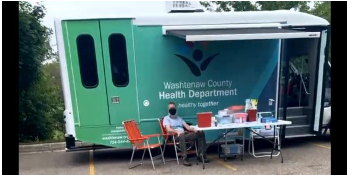
Center: Our new RV Mobile Clinic at Masjid Ibrahim's Pull Over Prevention