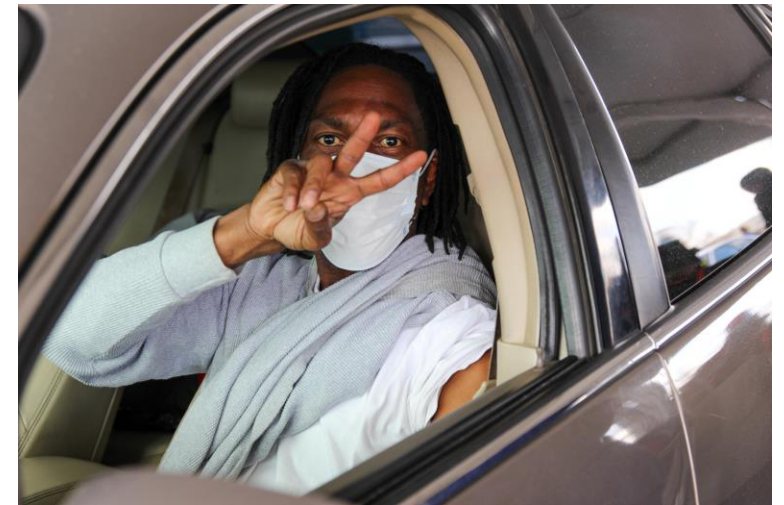
Partnering with the Latinx community, faith leaders in the Black community, REO, schools, businesses, senior housing