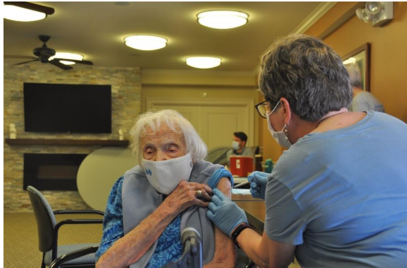
L to R: 108 year old getting her second shot!; Poster for a St. Francis pop-up for the Latinx Community; Drive-through pop-up