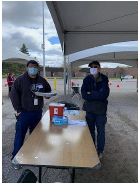
Left: Pop-up at Ypsilanti High School