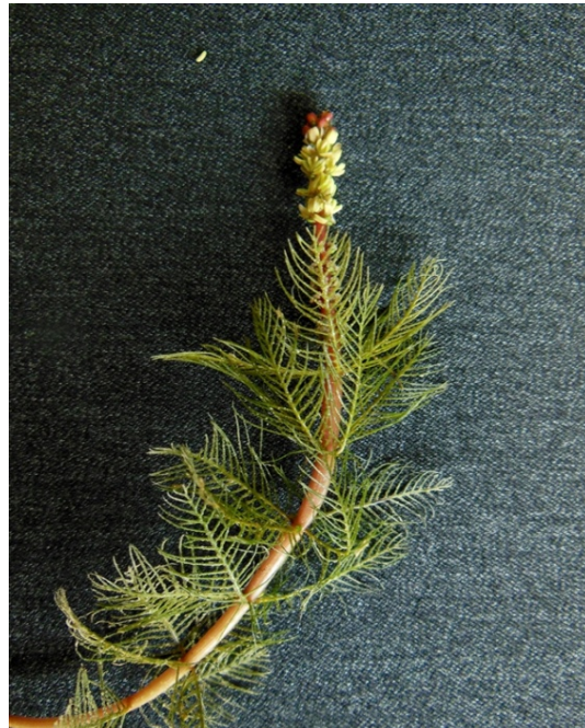
FIGURE 1 EURASIAN WATERMILFOIL ( MYRIOPHYLLUM SPICATUM )

EWM is a submerged aquatic perennial plant with finely divided leaves. Leaves are in whorls of 4 to 5 at the stem nodes and have more than 12 pairs of leaflets (Borman et al., 1997). Leaves are usually limp when pulled out of the water. Later in the summer season, these whorls may be several inches apart. The plant's long thin stems can reach up to 21 feet in length and branch repeatedly near the surface of the water to create a dense canopy. Flower stalks are above the water surface and range from 2 to 8 inches long. Flowers are small, located in the axils of the stalk, and whorled in small bracts. EWM does not have winter buds (turions).