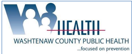
Emergency Department Admissions and Deaths Associated with Unintentional Opiate Overdoses Washtenaw County Residents January 2014 – June 2015