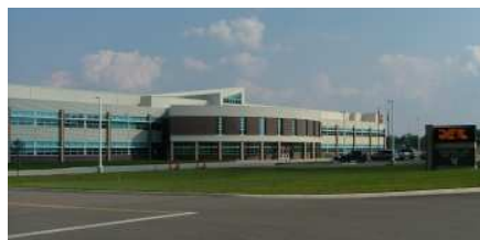
Whitmore Lake High School