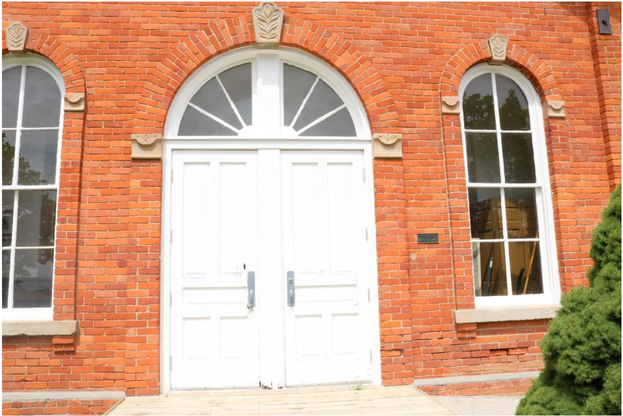
Geer School front doors