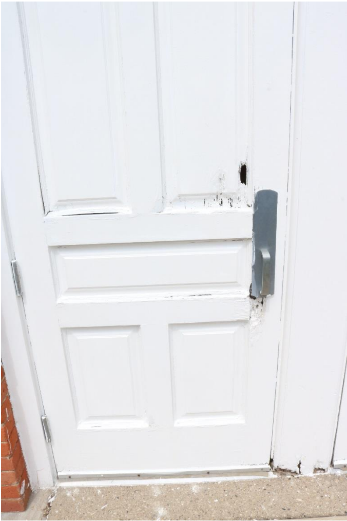
Left door detail