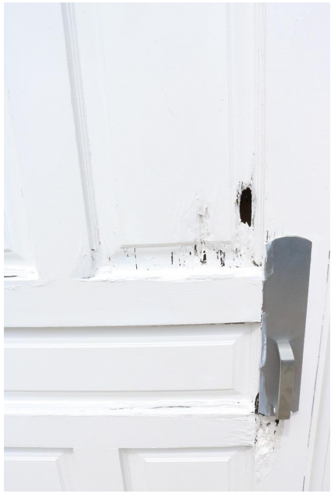
Left door detail