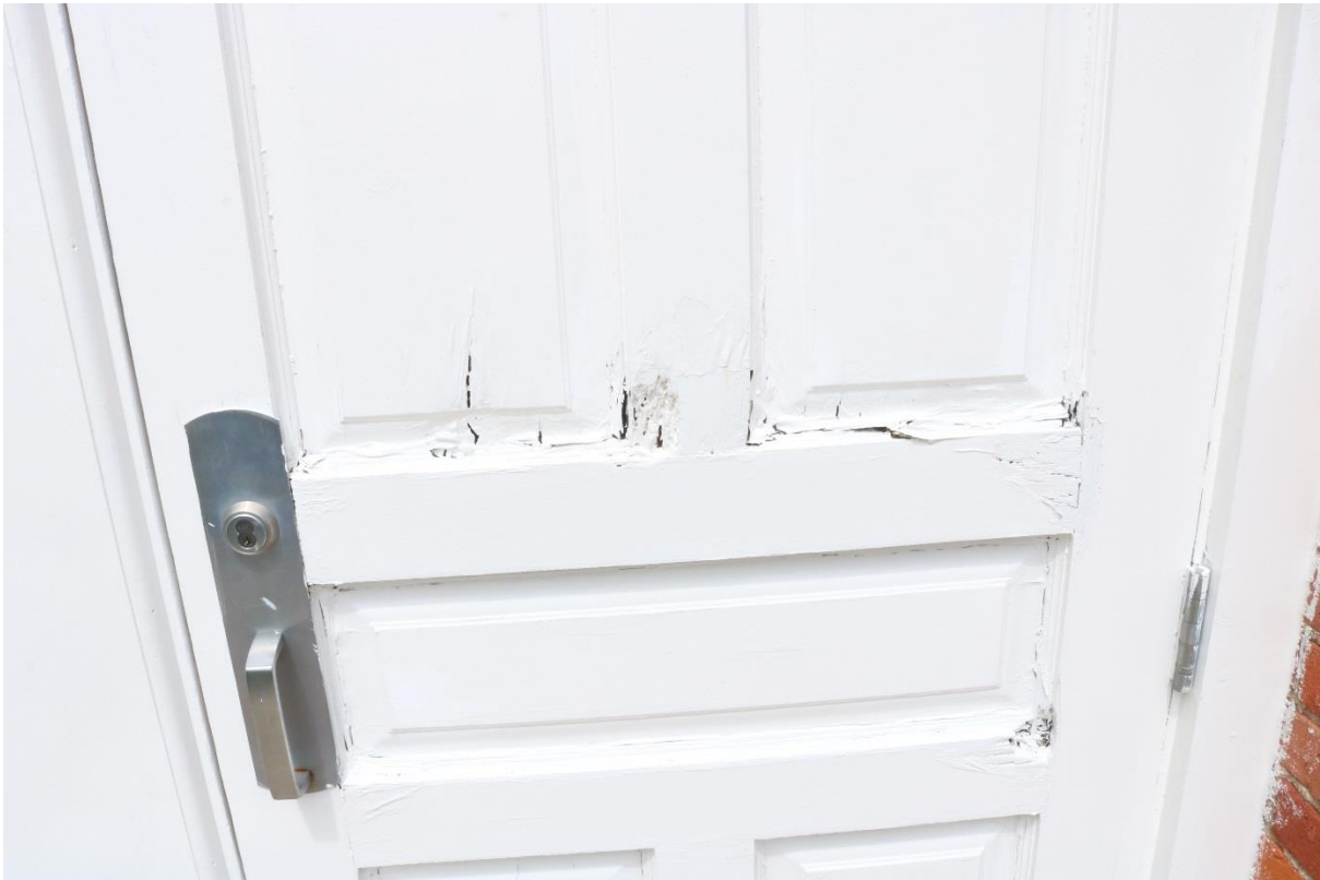
Right door detail